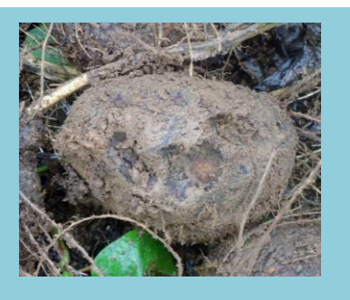
Papuana beetle damage

One of the main concerns of farmers is the damage caused by the following pests and diseases to the planting materials.