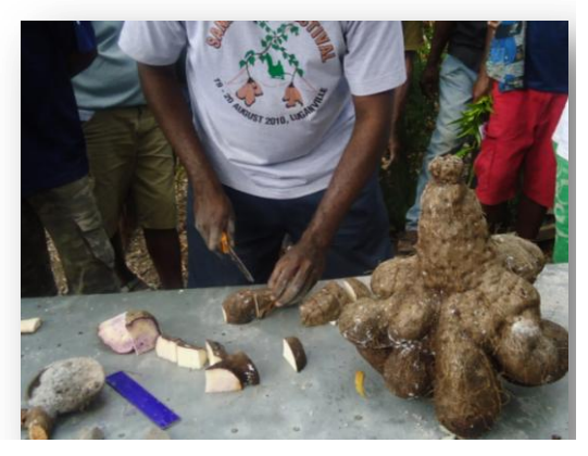
With the minisett technique, farmers use a small part a non-dormant tuber containing periderm and some cortex parenchyma.